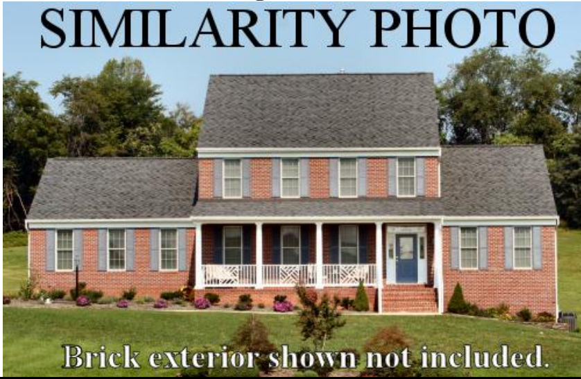
Brick exterior shown not included.